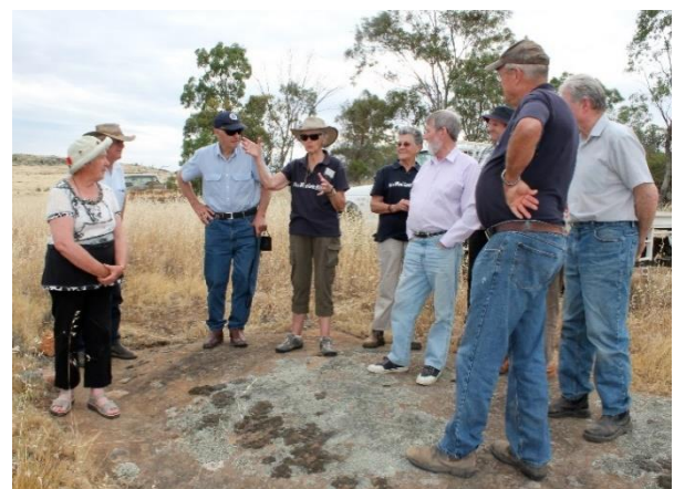
The Networks Committee of Management visit the Wychitella District Landcare Group at Mt Buckrabanyule in November 2013.