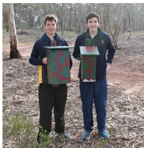
Year 9 Duke of Edinburgh Students from Wedderburn College with nestboxes

The day allowed the Network to see the successes of the TCCG and the Wychitella group was also able to take back some populations of the Cochineal Scale insect, a trial biological control agent. The agent has had success in inhibiting growth of Wheel Cactus in South Australia and the group will monitor its progress at Mt Buckrabanyule, with a view to releasing it across further areas of the mountain if successful.