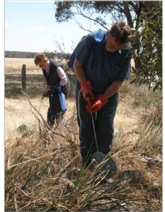
Friends of Kooyoora November activity – stabbing Wheel Cactus