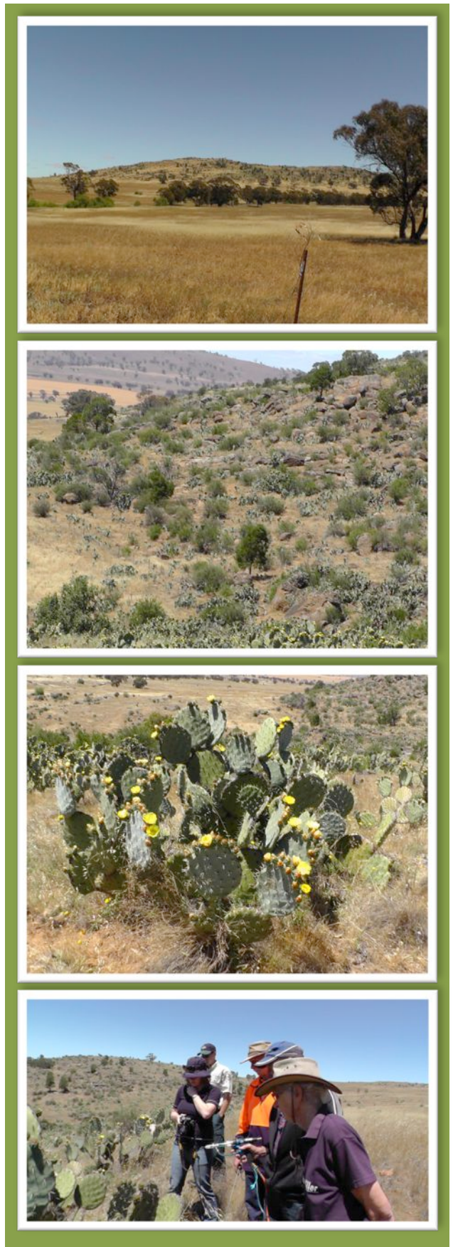
Partners and supporters of the Loddon Plains Landcare Network:

(from top to bottom): Mt Buckrabanyule, Core infestation of Wheel Cactus, a large Wheel Cactus specimen, locals and representatives.