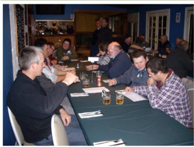
East Loddon Landcare Pub night attendees