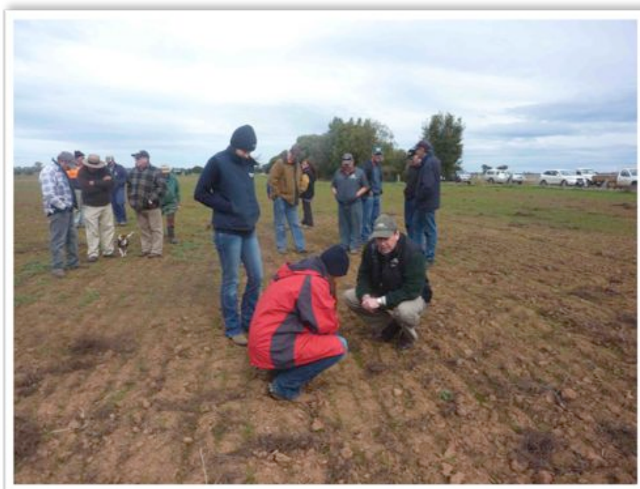
Pasture trial day – germination at the Condliffe trial paddock.