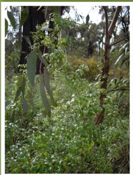
Photo: Bridal Creeper